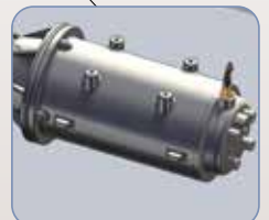
Thermal probe to prevent overheating of the electric motor