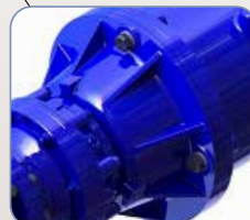
Planetary gear reducer for reduced energy consumption