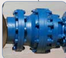
Double sealing system made up of two lip seals in cemented carbide