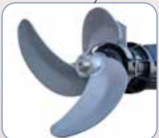
Engineered stainless steel 3-flight propeller for high efficiency agitation