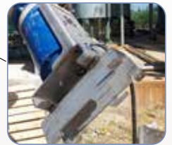
Adjustable support for different pipe diameters and brackets suitable for all cable types