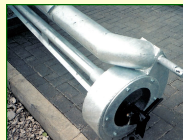
External fins break lumps and force feed the impellor for high outputs.

All pumps incorporate shearbolt protection of the drive shaft.